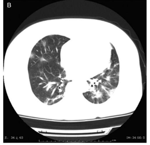
Figure 2: Chest CT images of a 47-year-old female patient upon admission, who had symptoms of fever for 7 days and post-exertional shortness of breath for 2 days (A and B). Transverse chest CT images showed the bilateral multiple lobular and sub-segmental areas of consolidation. CT: Computed tomography.